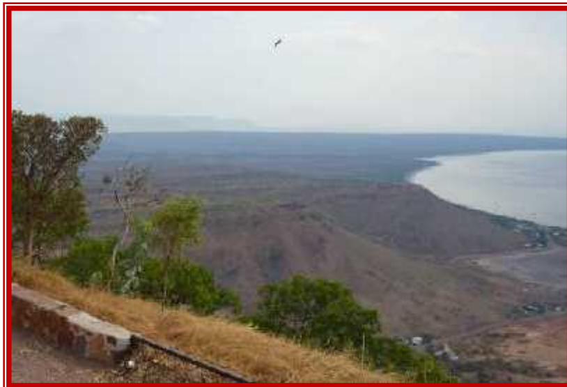
Five Rivers L/O

water either the driver or the passenger must go and check the depth of the water, the lay of the creek etc before crossing. So far, neither of us has been willing to do this because the signs at each of these river crossings warn that crocodiles inhabit the area – so with heart in mouth and fingers crossed and throwing caution to the wind, we moved forth. Obviously, so far we have been successful but maybe we should not push our luck too often! In Wyndham we went up to the Five Rivers Lookout – spectacular views of the area for miles. Wyndham is also home to The Big Croc.