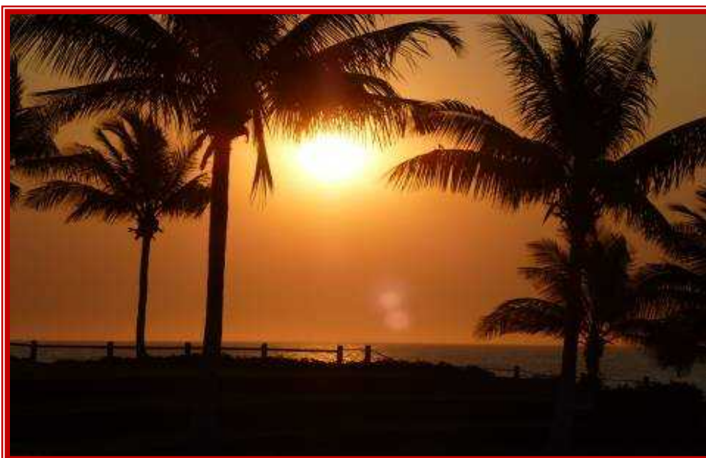
Cable beach sunset

There is a lot of building going on in Broome and the population is expected to increase if they go ahead with the liquid natural gas installation that is currently being considered (and demonstrated against). House prices here are around $750,000 for a three bedroom/two bathroom house and go up to around 2.5 million.