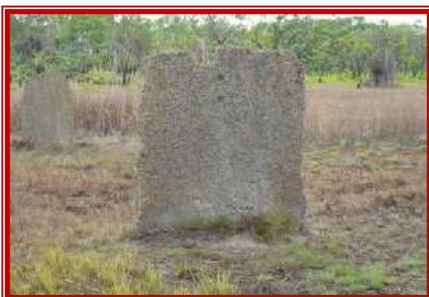
Magnetic Termite Mounds

Buley Rockholes - very slippery. Nice and cool on the feet though.