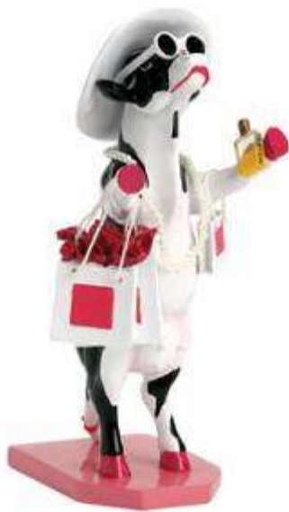
Alphadite Goddess of Shopping – Manchester 2004

The cow above is one of 85 cows in the 'Cow Parade 2010' (more info and pictures on the web – under 'cowparade2010'). It was not only an art exhibition, it also drew attention to the beef and dairy industries. At the end of the exhibition the cows were auctioned off for charity and a number are on display around the Margaret River area. I purchased a small version of a cow – I thought it was appropriate: